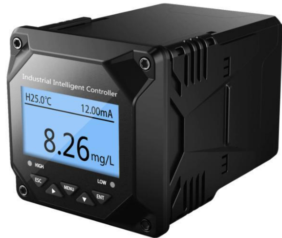
SUP-DM2800 Dissolved Oxygen meter

SUP-DM2800 Dissolved oxygen meter Measuring principle The oxygen molecules diffused through the membrane are reduced to hydroxide ions (OH-) at the cathode. Silver is oxidized to silver ions (Ag+) at the anode (this forms a silver halogenide layer). A current flows due to the electron donation at the cathode and the electron acceptance at the anode. Under constant conditions, this flow is proportional to the oxygen content of the medium. This current is converted in the transmitter and indicated on the display as an oxygen concentration in mg/l, µg/l, or Vol%, as a saturation index in % SAT or as an oxygen partial pressure in hPa.