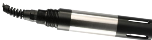
Dissolved Oxygen Sensor (Replaceable membrane head)